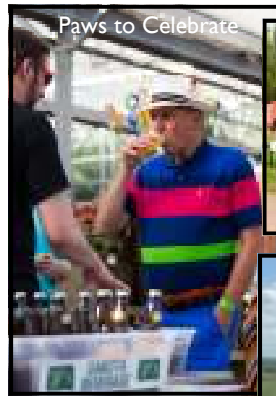
Paws to Celebrate

community and our volunteers. Thank you so much for your time and commitment that made the 2015 year such a success for the SFAHS!