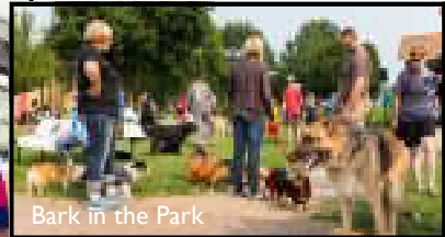
Bark in the Park